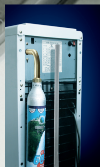
터사 뒷면 디자인

You can put cups and water bottle on the tray which increases convenience and appearance of the device.