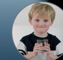
For a fun, fizzy alternative to those unhealthy sodas.