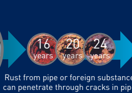
Rust from pipe or foreign substances can penetrate through cracks in pipes