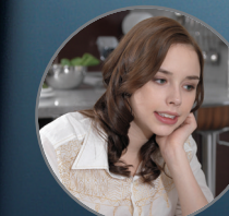
For flavorful, calorie-free mealtime drinks.