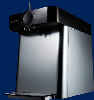
COWAY CARBONATED WATER FILTRATION DEVICE / CPC - 08FU

That is what the CPC-08FU delivers - even with water straight from your tap. Trapping pollutants and particulates while allowing healthful minerals to pass, the compound activated charcoal filtration system produces the purest of pure water, ready to drink as is or to carbonate for that effervescent lift.