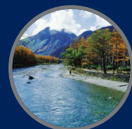
Sewage Disposal plant