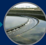
Foreign Substances inside of 2nd Water Tank(Ca, Mg, scale etc)