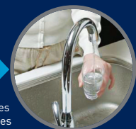
Tap water might contain mercury, Zinc, Cadmium, Lead, Copper, or Iron...

Expensive sparkling water VS Economical sparkling water