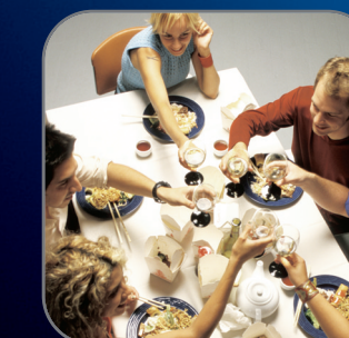
For between meal and evening refreshment.

For every generation and every situation... the next generation of pure water technology: Coway.