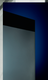
담사 뒷면 디자인